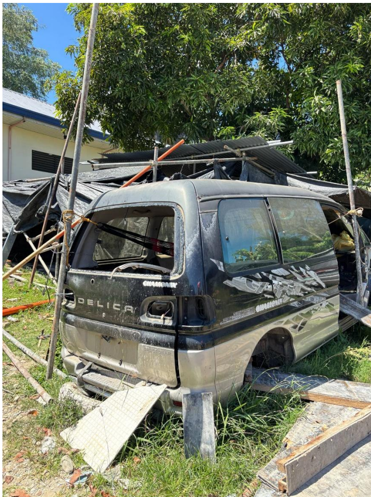
14. Mitsubishi Delica D:5, maximum power of 109ps ,AWD (no papers)