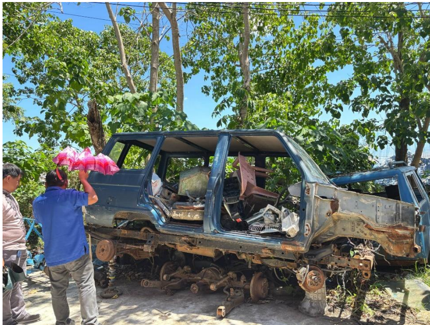
12. 1997 Toyota Tamaraw 1.8L FX GL MT MPV. Diesel engine, Manual transmission, Maroon Color, Plate No. SDT 154, Chassis No. CF50-002789, Engine No. 2C-2632282