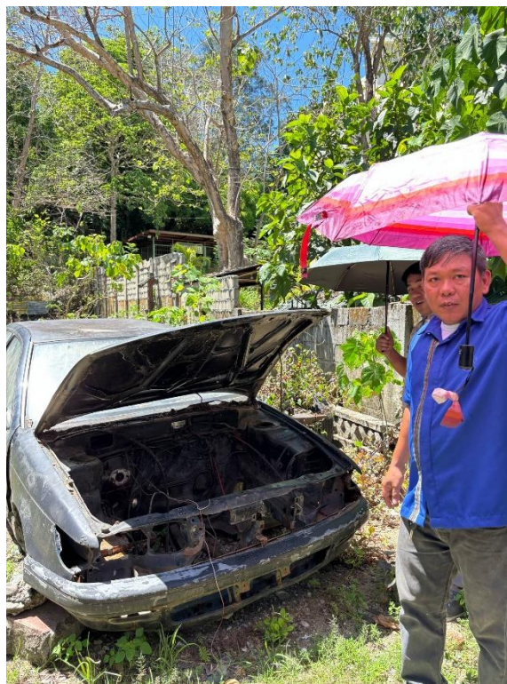
16. Mitsubishi Lancer (no papers)