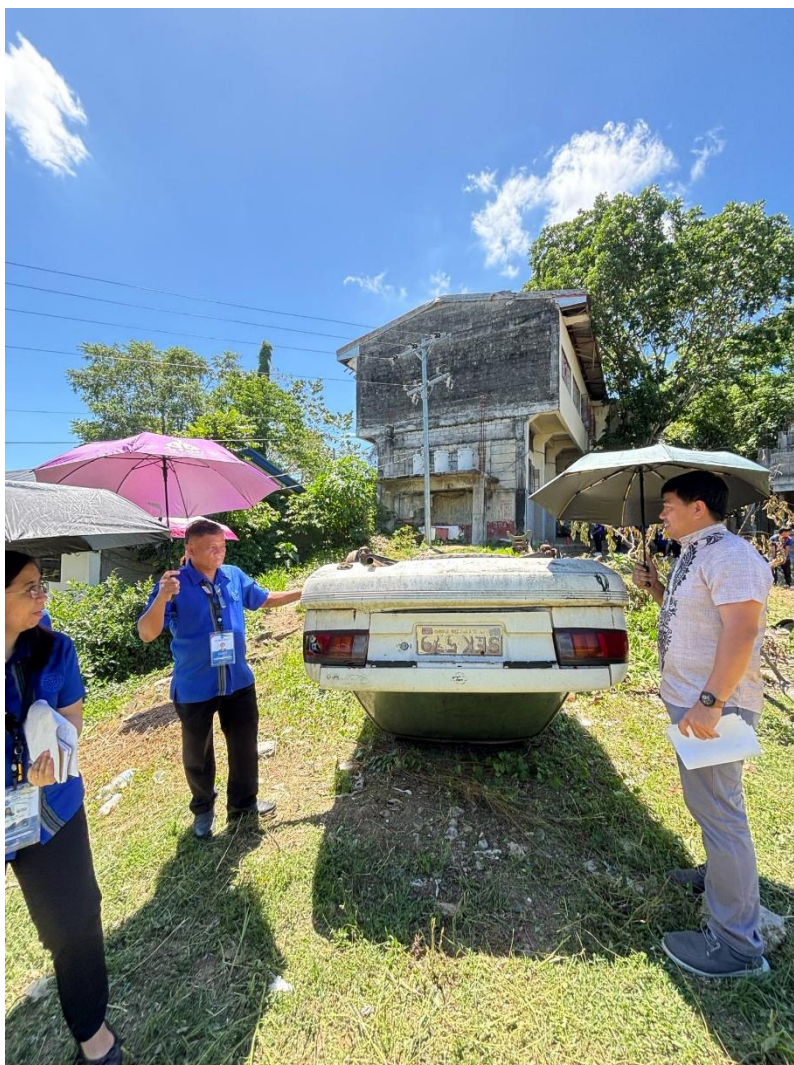
10. 1996 Nissan Sentra, 1.6L 4-cylinder engine, 110 horsepower, 6000 RPM, speed manual transmission, white color, Plate No. SEK 579, Chassis No. , Engine