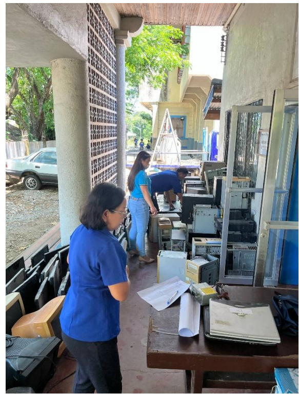
20. Assorted ICT Equipment