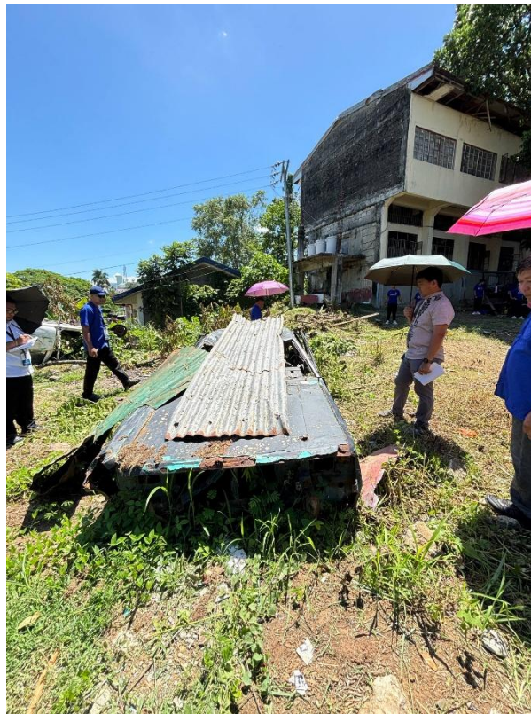
15. Mitsubishi Lancer (no papers)