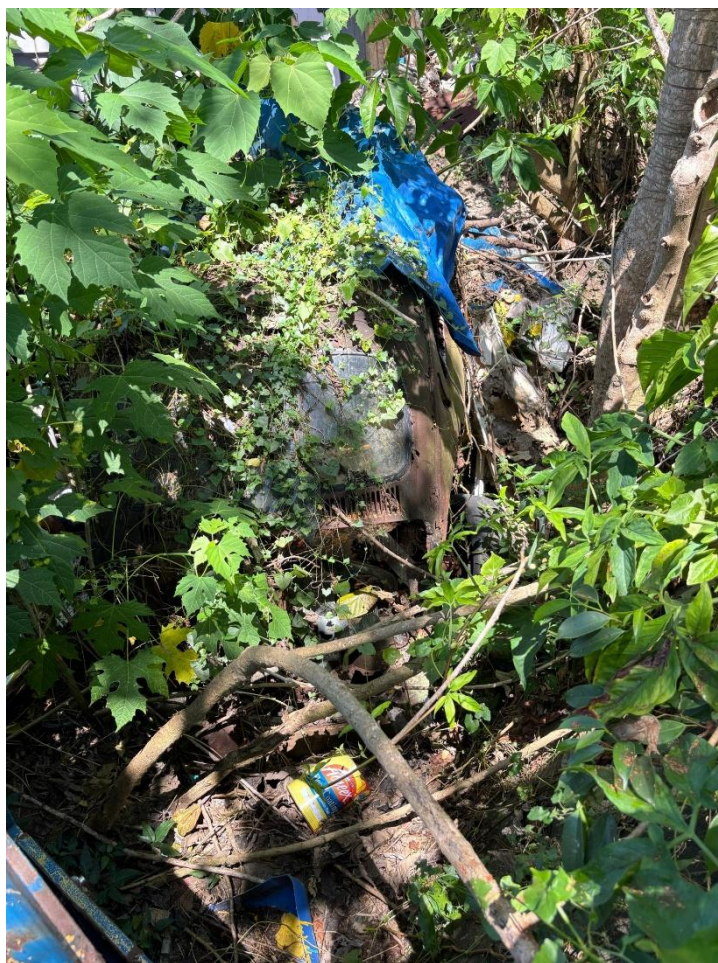
19. Volkswagen (no papers)